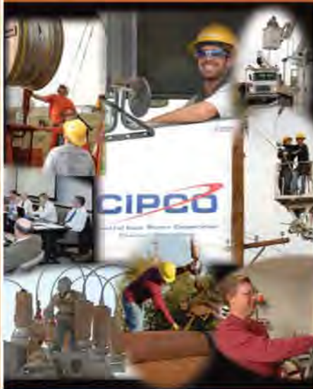
The Power of Human Connections