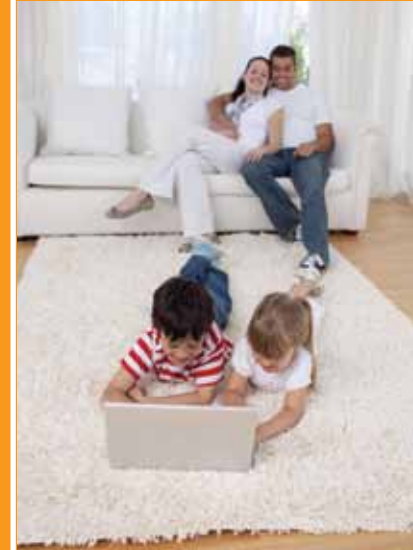
The Power of Human Connections