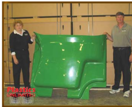
Plastics Unlimited • Preston, Iowa

The RLF requires adequate collateral for the loan request. Preferred security is an irrevocable letter of credit or a first lien on real estate and/or machinery & equipment.