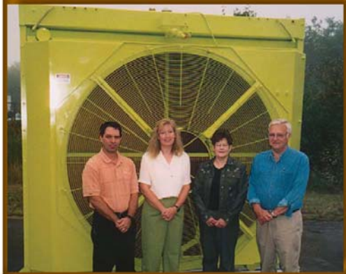
L&M Radiator • Independence, Iowa

Improving the quality of life in rural Iowa