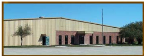
Precision Pulley & Idler located at the Blue Grass Industrial Park • Corning, Iowa